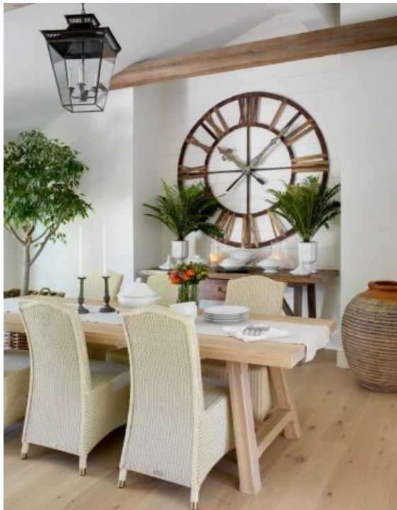
The house has several cozy accents.