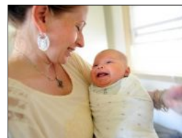
Safe baby sleep habits focus of proposed law