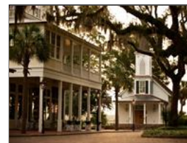
Discover South Carolinas' Best Kept Secret