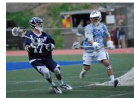
Defense leads Staples past Wilton in boys lacrosse