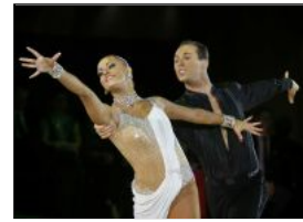
Stamford couple feature on PBS ballroom series

4 Ways to Avoid Running Out of Money in Retirement Fisher Investments