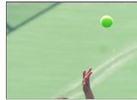
Ludlowe edges Staples to win 3rd straight girls tennis title