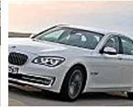
These 15 New Cars Are Real Stinkers: Cars to Avoid Buying in 2015 Forbes