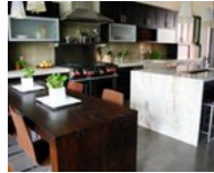
Are Granite Countertops Over? See What's New In Kitchens HGTV