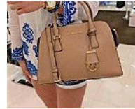
Must-Have Michael Kors Bags Being Sold for Next to Nothing LifeFactopia