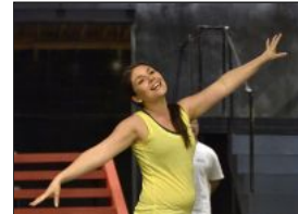
Curtain Call ends season with 'Follies'