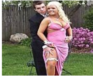
17 Hilarious Prom Photos That Will Make You Glad You're Done With... Minq