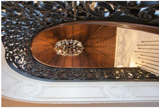
The marble stairway at 27 Hampton Road was salvaged from the Waldorf Astoria