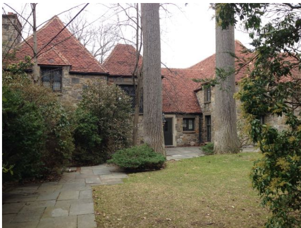
The childhood home of Robert Durst at 27 Hampton Road is on the market for $3.8mm

REAL ESTATE PUBLISHED ON THURSDAY, 09 APRIL 2015 16:53 JOANNE WALLENSTEIN