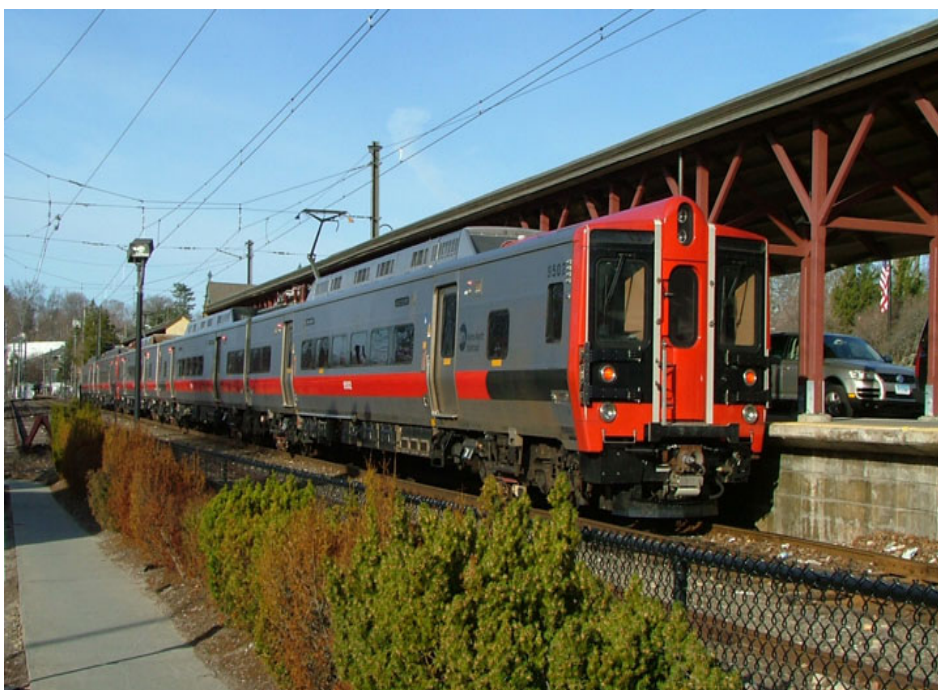
One of the advantages of taking a train from the end of the branch line in New Canaan is that riders get the first seats as the train waits to depart. This is the 7:58 a.m. train on April 15.

By Kristan Sveda on April 18, 2015 in Latest Local News New Canaan CT, Lead News, News, Real Estate · 0 Comments