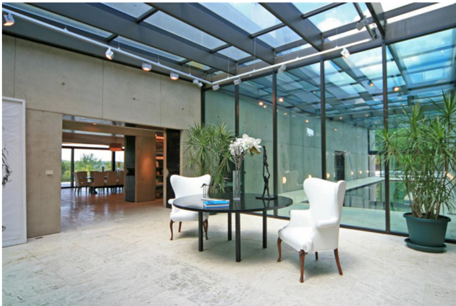
191 Ridgebury Road, Ridgefield, Conn. $19,500,000