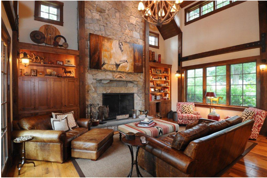
26 Covelee, Norwalk, Conn. $2,125,000