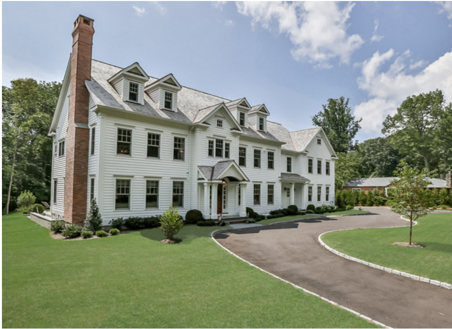
16 Greenwood Lane, Westport, Conn. $3,199,000