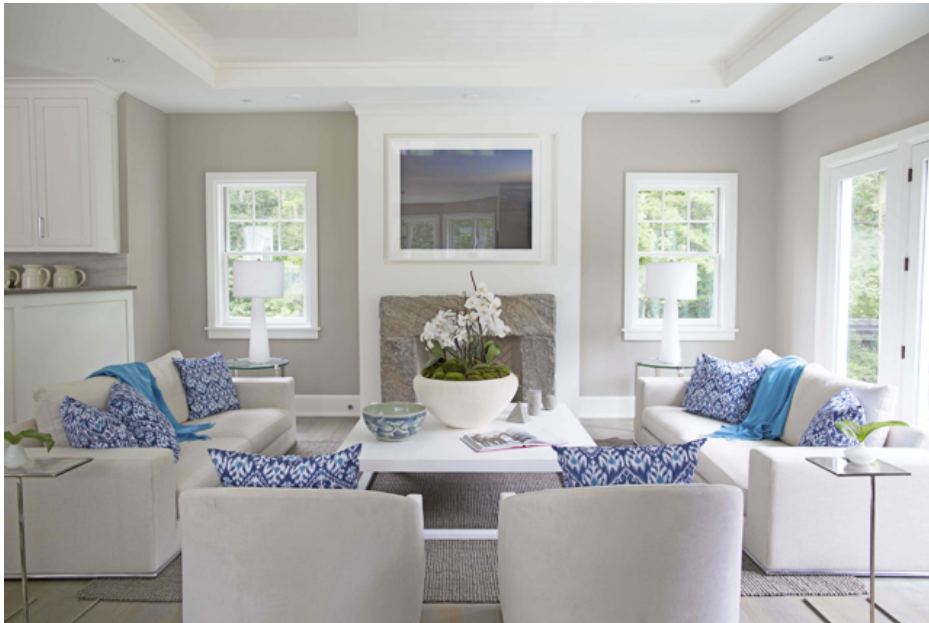
14 Charcoal Hill Road, Westport, Conn. $4,350,000