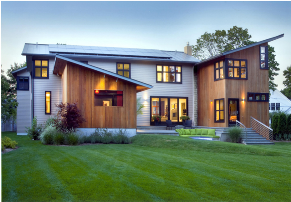
39 Danbury Avenue, Westport, Conn. $2,995,000