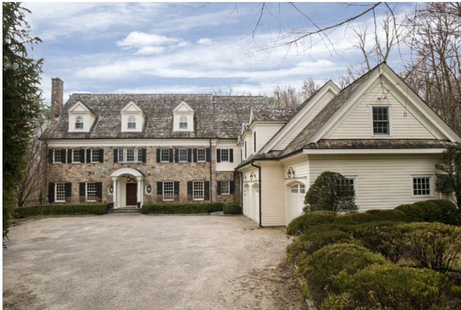
173 Ferris Hill Road, New Canaan, Conn. $4,995,000