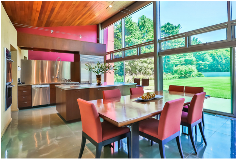
16 & 14 Burr School Road, Westport, Conn. $3,700,000