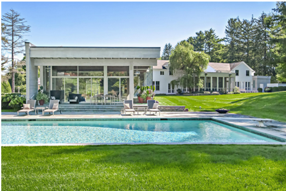
109 Old Branchville Road, Ridgefield, Conn. $4,600,000