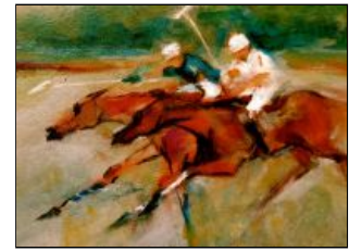
Painting the field: Artist sets out to capture the pulse of polo

The best way to set your thermostat during the winter months Champion Windows