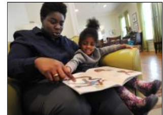
Law would improve benefits for female veterans