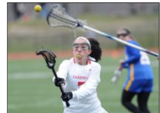
Big second half propels Greenwich girls lacrosse team past Brookfield