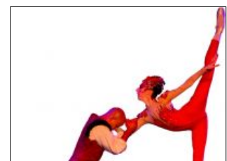
New England Ballet's busy April in Bridgeport