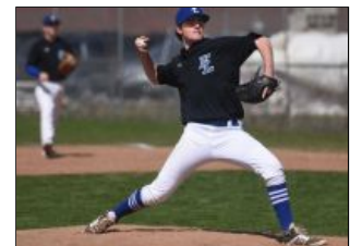
Greenwich High baseball team edged by Ludlowe in home-opener