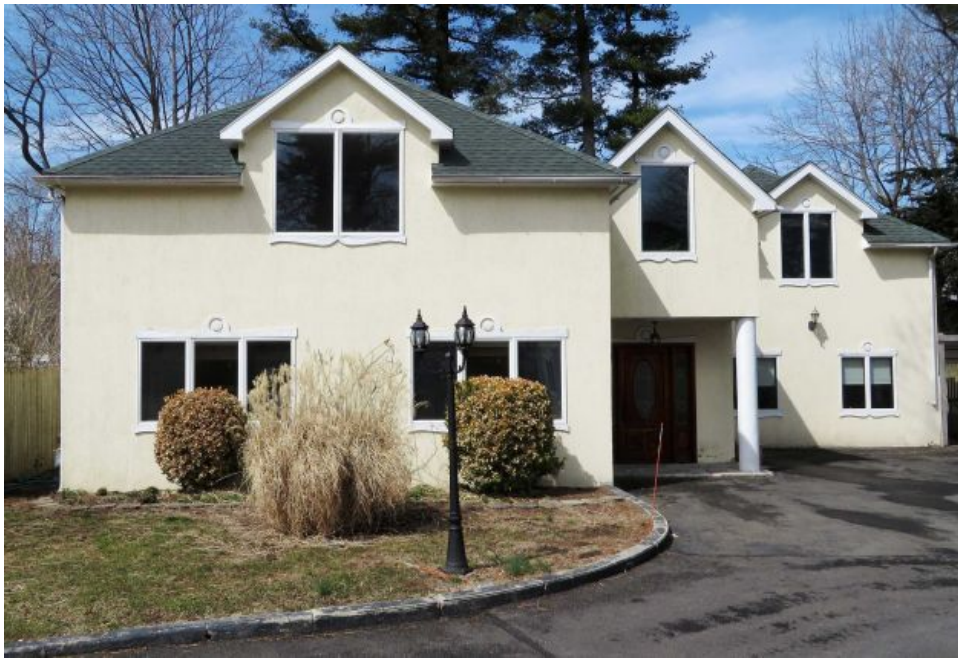
The property at 47 Crescent Road is on the market for $799,000.