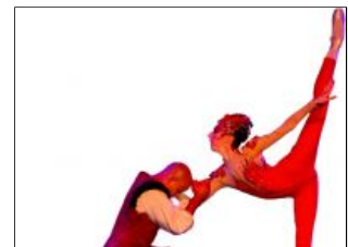
New England Ballet's busy April in Bridgeport