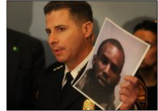
One arrested, another still sought in homicide