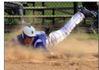
Rossomando, Bunnell roll past ND-Fairfield