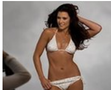
The Beautiful, Danica Patrick! Full Throttle LEGENDS