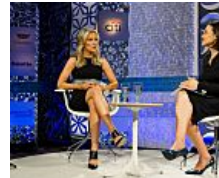
How Megyn Kelly's husband, Sheryl Sandberg (and I) realized she's a... Fortune