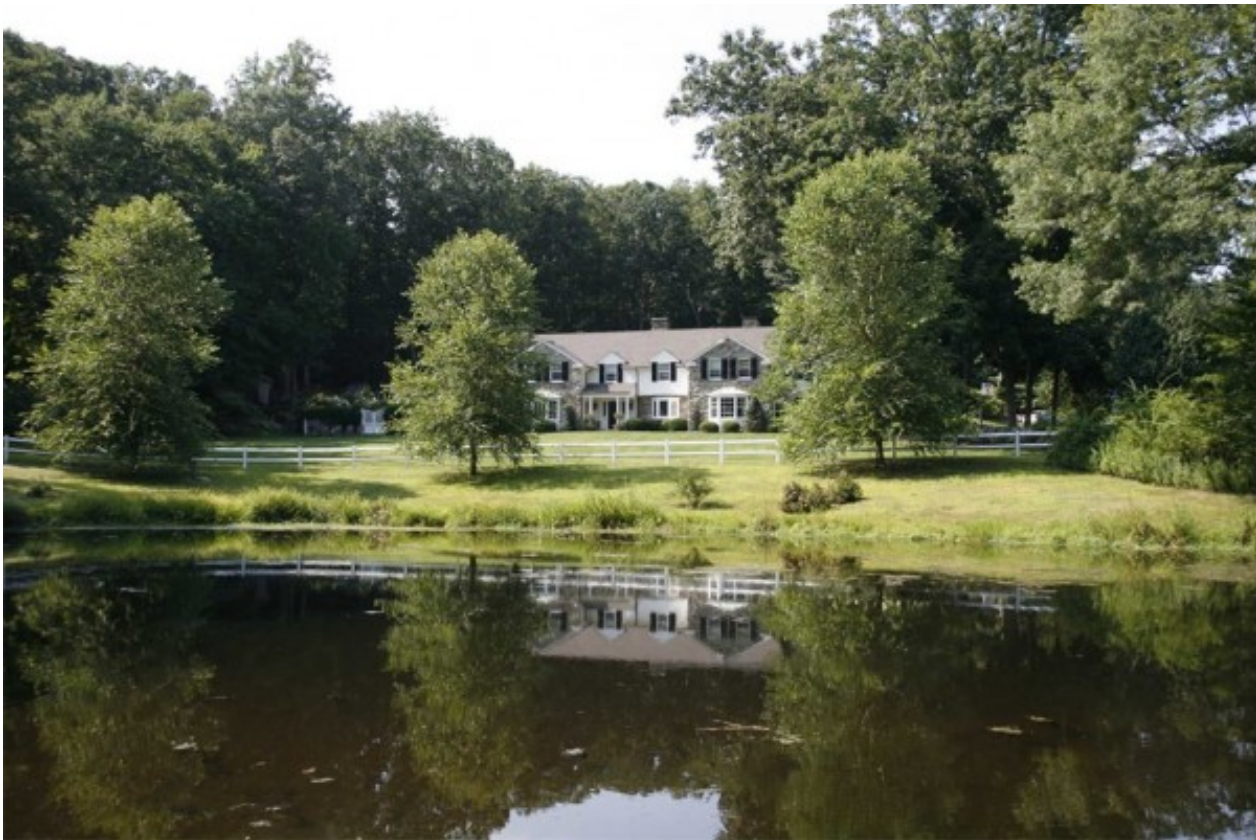
1516 Riverbank Road Stamford is on the market for $2.3 million.