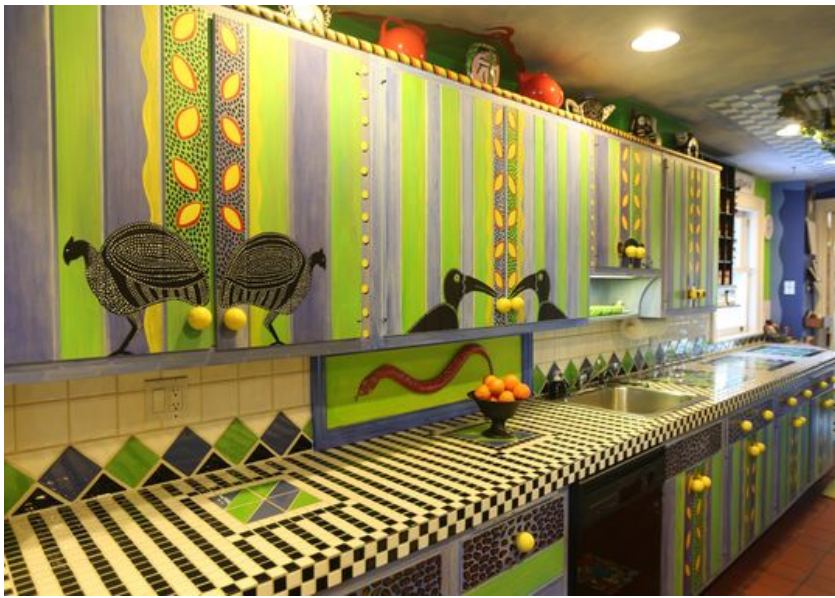
<p>The kitchen might just be the most colorful and creative room in the house</p>