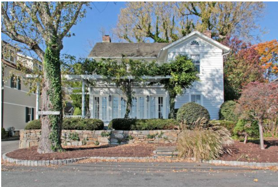
The property at 1088 Harbor Road is on the market for $3,685,000.