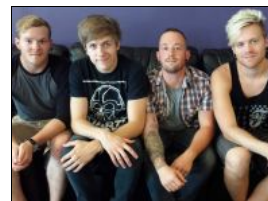
What's happening this weekend in the Danbury area