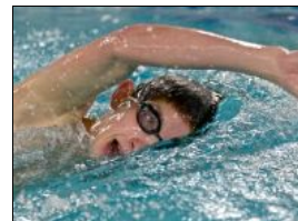
Bethel swimmers impressive in victory over Oxford