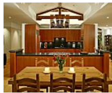
3 Kitchen Trends To Watch In 2015 ImproveNet