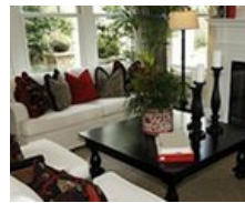
36 Living Room Designs that Drove Home Buyers Crazy Home Stratosphere