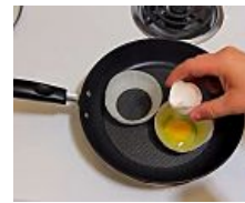
He Cracks The Egg Over Onion Rings, And Reveals This Kitchen Trick...