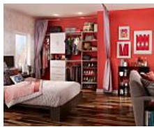
For Those Without Closets, These Wardrobe Ideas Are Amazing... HGTV