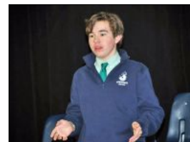
Students explain choice of monologue