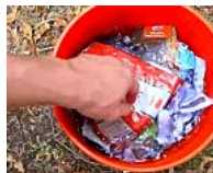
He Puts His Junk Mail In A Bucket Of Water. When You See Why, You'll Be Amazed. LittleBudha.com