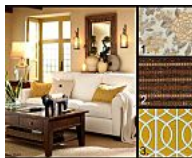
Find Out What Home Decor Style You Prefer? 3 Day Blinds