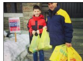
The record: things in and around Greenwich