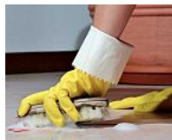
This Home Cleaning Startup Saved Me Hundreds Of Dollars Business Insider