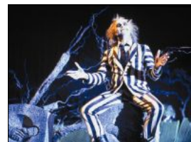
'Beetlejuice' returns to the big screen for one night