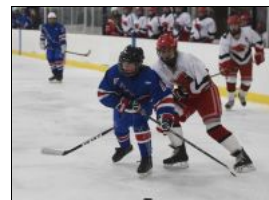
Greenwich girls hockey team falls to Fairfield