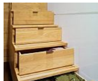
7 Storage Solutions You Didn't Know Had HouseLogic