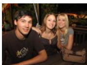
Houston bars that host trivia nights