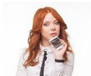
This App is Quick...