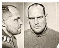
10 Terrifying Last Words...