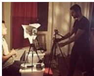
These 27-year-olds made...