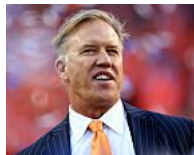
Hall of Fame Athletes Who...