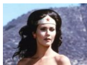
Actors in their 60s: Then and now