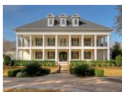
What $1 million buys in Spring real estate