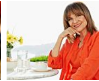
Beloved TV Star Battling Incurable Lung Cancer Proves That Each Day... AARP