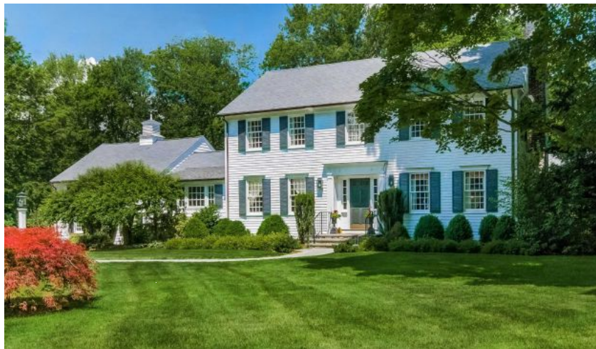
The property at 3420 Congress St. is on the market for $1,475,000.