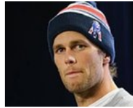
14 Biggest Cheaters In Sports History...#6 Will Shock You! PressroomVIP