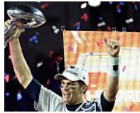
IRS Sacks Tom Brady With 'Super' Tax Bill Fox Business