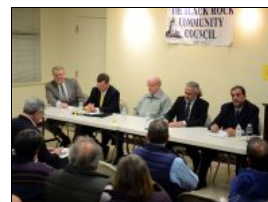
Heated debate among Bridgeport candidates for state House