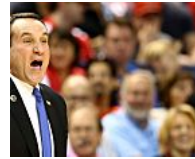
The 20 Highest-Paid Head Coaches in Men's College Basketball Worthy