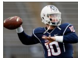
2015 UConn Football Schedule