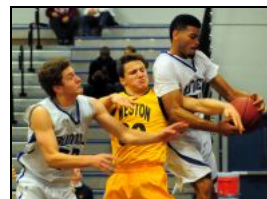
Bunnell tops Weston for 12th straight victory