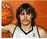
40 Biggest NBA Draft Busts Ever: Where Are They Now? LostLettermen