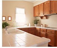
Remove These 8 Things From Your Kitchen NOW BuildDirect