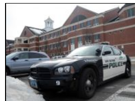
Report: Kids behaving better in school