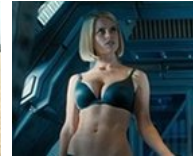
The 10 Biggest Movie Flops Of All Time Movieseum

Stamford cop makes state's top 50 Latino list