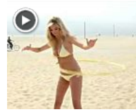
Video: Kate Upton Takes on the Wet T-Shirt Contest GQ