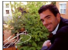
Sinatra show to benefit Make-A-Wish